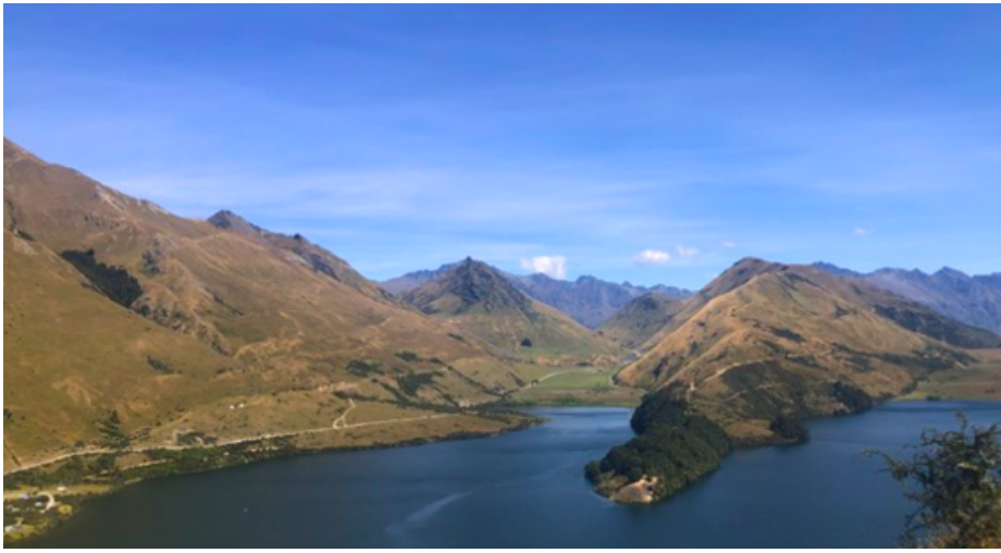
MOKE LAKE - NEW ZEALAND