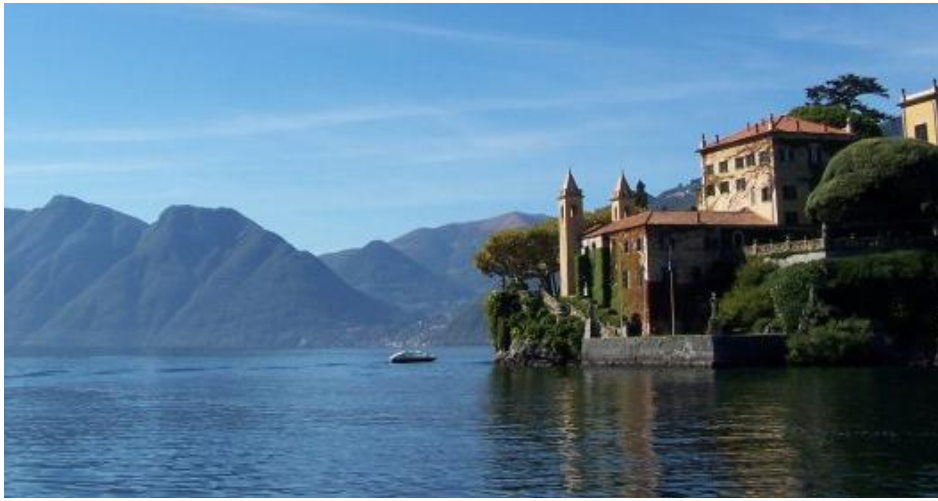
LAKE COMO - ITALY