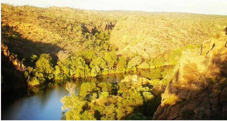
NITMILUK GORGE - NORTHERN TERRITORY