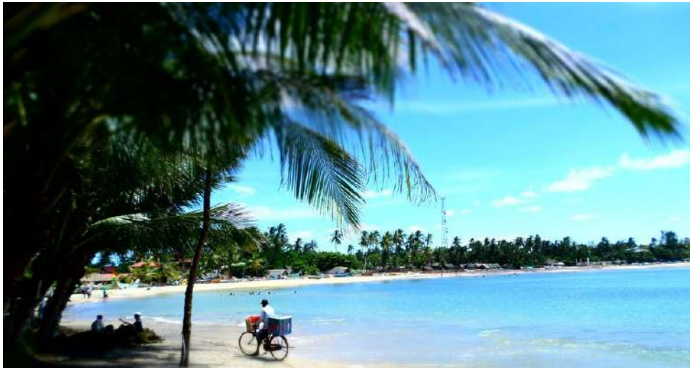
ARUGAM BAY - SRI LANKA